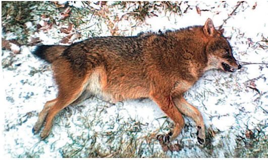
Fig. 1. Golden jackal killed by hunters in December, 2009 on the border between Khmelnytsky Reg. (vil. Novokostiantyniv) and Vinnytsia Reg. (vil. Osichok).

Рис. 1. Шакал, здобутий мисливцями у грудні 2009 р. на межі Хмельницької (с. Новокостянтинів) та Вінницької областей (с. Осічок).