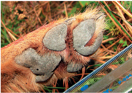
Fig. 2. Connate pads of the medial toes on the jackal's forelimb from the Donetsk Reg. Photo by Alexander Bronskov.

Рис. 1. Шакал, здобутий мисливцями у грудні 2009 р. на межі Хмельницької (с. Новокостянтинів) та Вінницької областей (с. Осічок). Фото Олега Гулька, 13.12.2012.